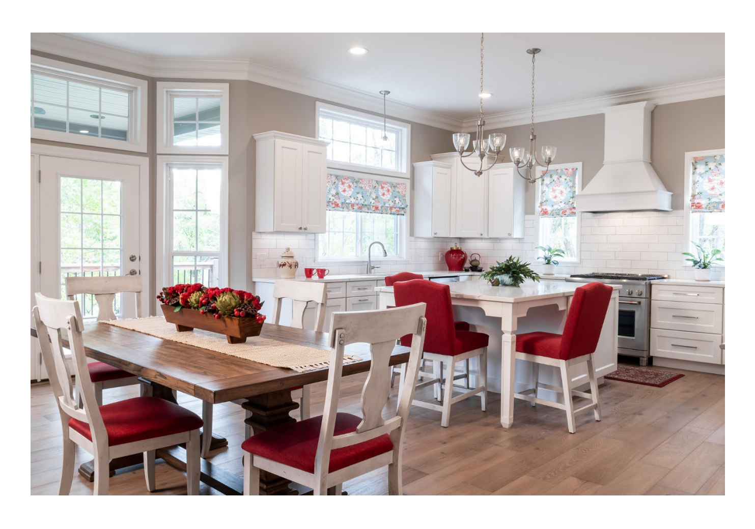
This traditional all white kitchen received a joyful splash of red.