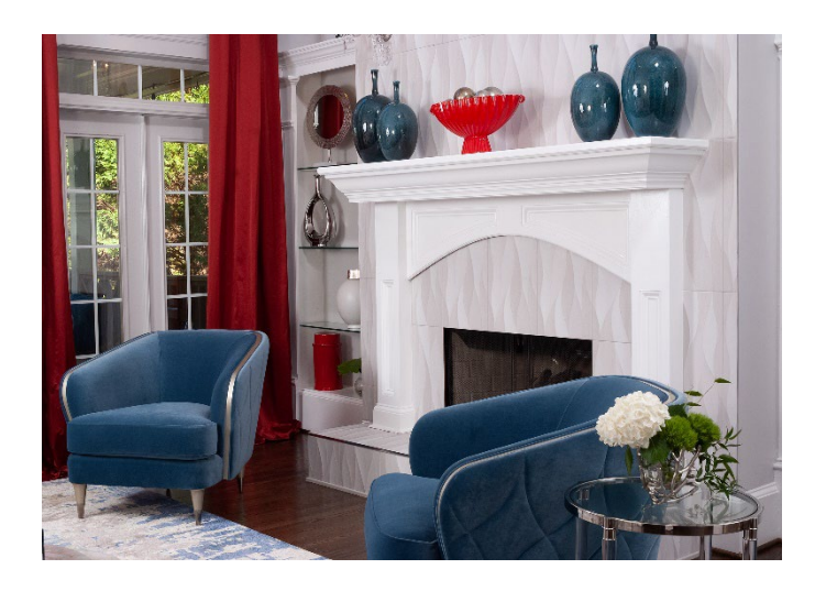
Vivid accessories add emphasis

Look to nature for inspiration for adding texture. The use of stone or wood accessories can both add texture and create a more peaceful outdoor-like sanctuary.