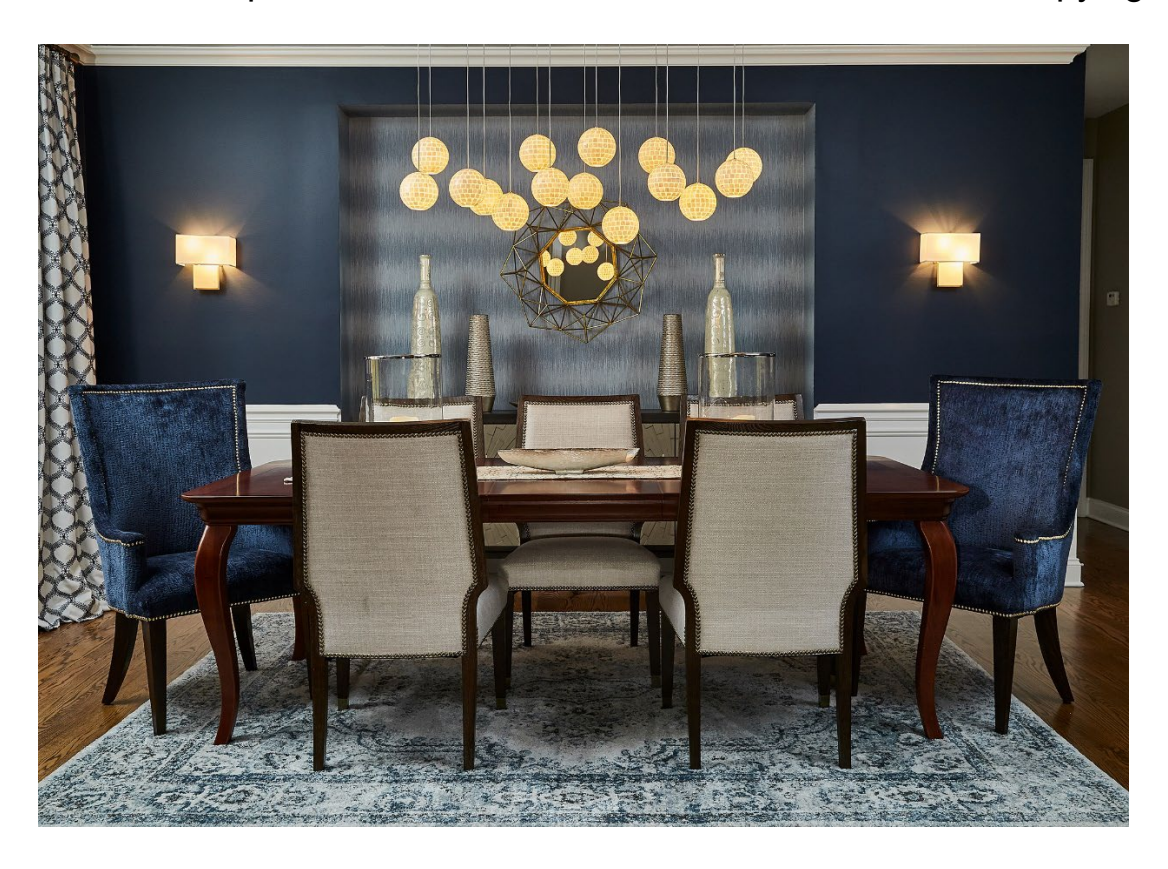
Navy, gray and ivory in a big way.

Dorothy Draper, an influential decorator in the early 1900s who revitalized the Greenbriar Hotel in West Virgina, believed that color not only adds ambience to a space, but also influences the mood of those occupying it.