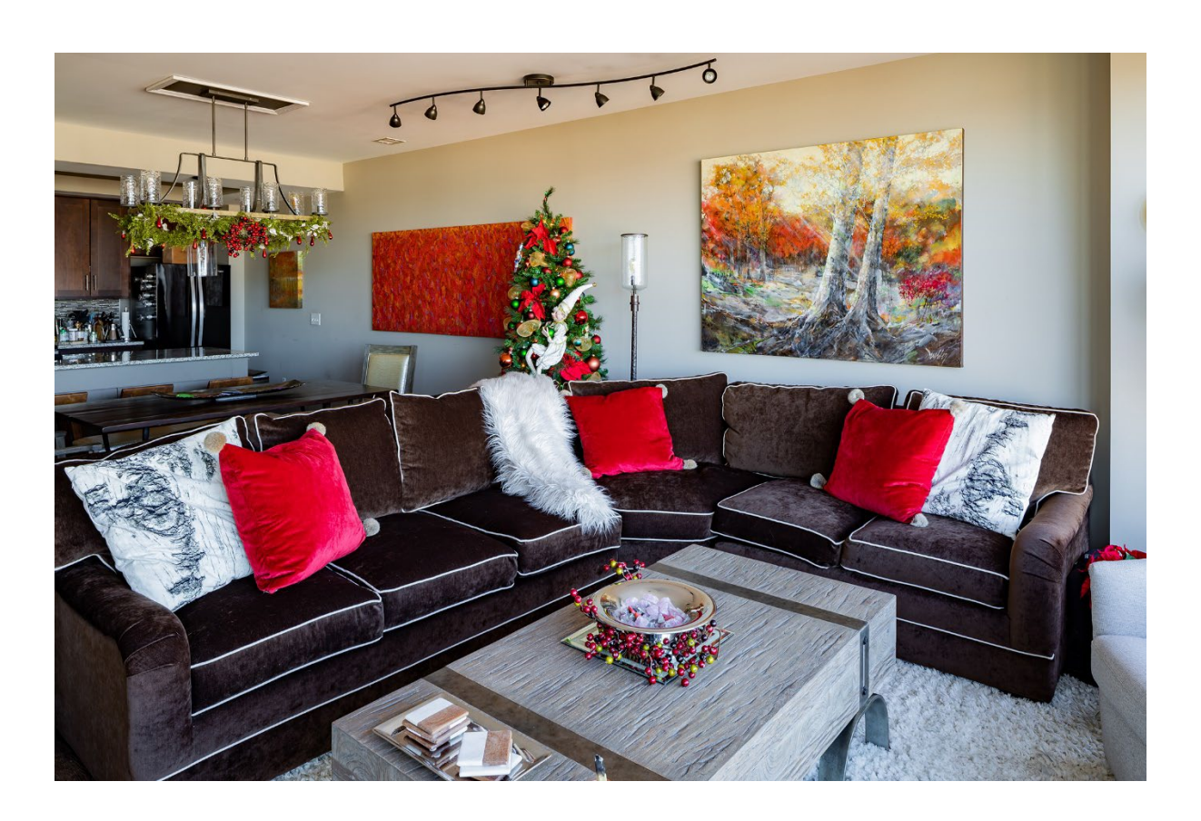
Pillows and wall art can do wonders.

Do splashes, not pops. If a bold colored sofa or accent wall is too much, use lighting, art, rugs, vases, bowls, or other accessories to add splashes of color.